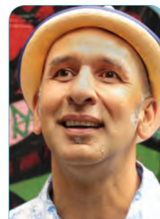
Gilbert Rocheuste Village Well