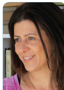
Kylie Legge Place Partners