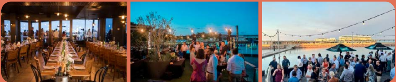
The stunning Darwin Waterfront location for the Place Leaders Awards Presentation and Dinner

Place Leaders Asia Pacific acknowledges the generous support of Activate Darwin as 2024 Awards Partner.